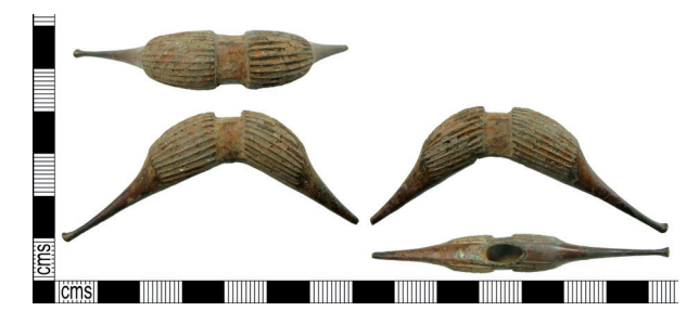
Fig. 3. Bronze-Age 'moustache-like' object.

Before the discovery of the Bix hoard it was already a 'Bronze-Age year' for the PAS in Oxfordshire. Forty-nine objects were reported and recorded in 2015, compared to the usual ten or so. Thirty percent of these finds come from an area to the north of the Thames between the parishes of Grafton and Northmoor and