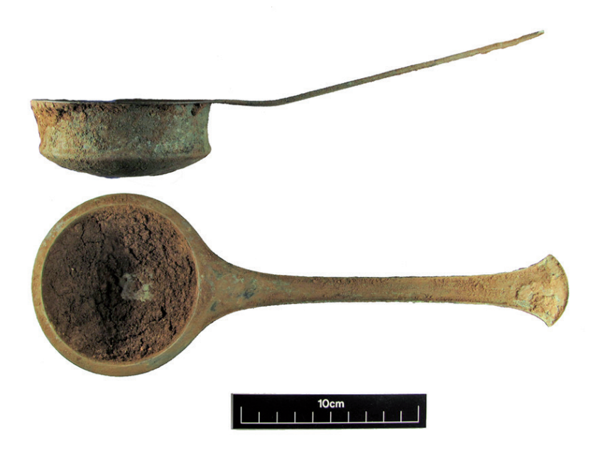
Fig. 6. Long-handled pan from Rollright.