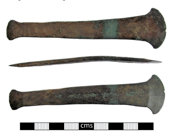
Fig. 4. Early Bronze-Age chisel or flat axe.

Two other Bronze-Age 'finds of note' came from Kingston Bagpuize. A complete socketed axe of Needham's Class B, Southern English ribbed axe (Ewart Park phase c.950-750 BC) is the first of its type recorded by the PAS from Oxfordshire.<sup>5</sup> A very unusual early flat axe or double-ended chisel (Fig. 4)<sup>6</sup> of early to middle Bronze-Age date (c.2300-1200 BC) has not yet been paralleled, although an object illustrated in Evans described as a chisel and from Plymstock in Devon, is similar to and the same length as the Kingston Bagpuize example (figure 4).<sup>7</sup>