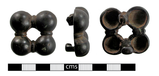
Fig. 9. The domed Iron-Age brooch from Southmoor.

Southmoor (BERK-09448A) (Fig. 9) This cast copper alloy brooch is formed of four hollow bulbous domes arranged in a square creating an open lozenge-shaped centre. The domes are linked together by a short plano-convex neck decorated with simple vertical lines across the width of the moulding. On the reverse the robust catch-plate and double pin lug are retained and a fragment of the iron pin can be seen.