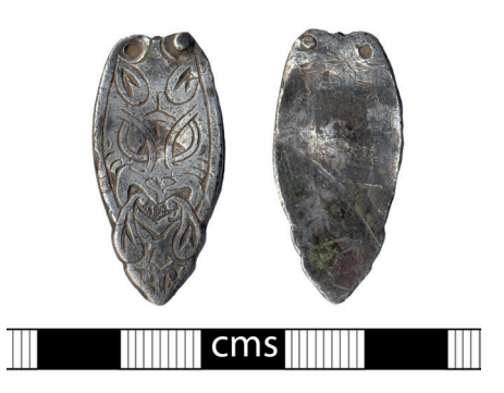
Fig. 7. Early medieval strap-end from Lew.

Strap-ends are probably the most commonly reported of all early medieval artefacts, with the vast majority being of copper alloy. A complete silver example from Lew merits mention for its intricate design (Fig. 7).<sup>19</sup> A variant of the Class A Type 1 Trewhiddle-style strap-end of ninth century date,<sup>20</sup> this example differs from most strap-ends by not having a separate dominating panel above the zoomorphic terminal; rather the entire face of the strap-end is one integrated design. The pointed terminal shows a short snouted beast with two eyes and two large teardrop ears lying flat on the back of the head. These two ears also form the base of the second zoomorphic design which dominates the majority of the strap-end. A feline-type creature, it has