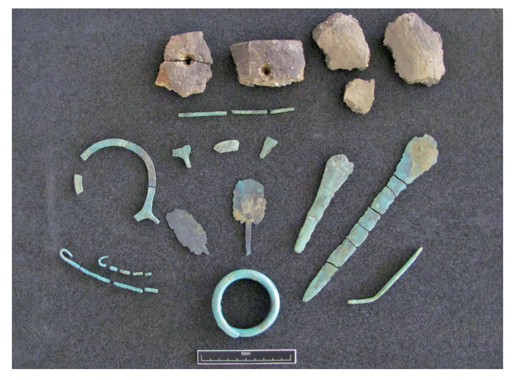
Fig. 2. The Bix hoard.

Jonathan Long of Reading, thought he might have uncovered some artefacts in situ after finding several small fragments of bronze and one complete decorated 'Liss'-style bracelet in the plough soil. Excavation revealed the heavily truncated remains of a bucket urn, laid on its side possibly in a small pit. More than half of the vessel was missing but one side was complete from base to rim; two suspension holes were noted near the rim of the vessel. Scattered, fragmentary artefacts were recovered from within the remains of the vessel and the area around it. At the base of the vessel were two razors, one of which was decorated. The razors were probably interred in their damaged condition as they had not been disturbed by the plough. Also lying within the vessel were the remains of a rapier or dirk and of a pin(s) and a spiral torc. The decorated bracelet and several rapier and quoit pin, pin and torc fragments came from the surrounding plough soil. In all, c .19 individual objects are represented within the c .85 fragments recovered. This assemblage appears to be the first Middle Bronze Age 'Ornament