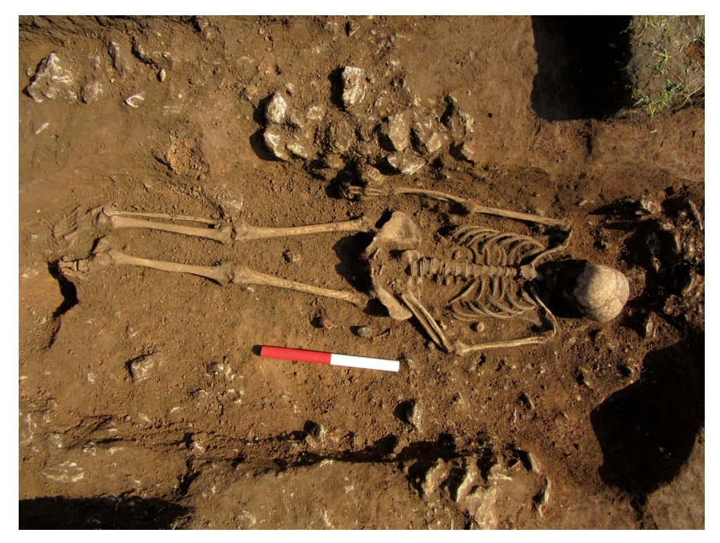
Fig. 5. The 'Rollright burial'.