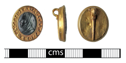
Fig. 10. Medieval seal matrix from Epwell, north Oxfordshire.

This wonderful gold medieval seal matrix was one of the last finds reported in 2015. Of thirteenth-century date, it is in exceptional condition. The gold mount holds a dark green jasper intaglio, intricately engraved to depict a female in profile. The female wears a long veil about her head with either hair or possibly pearls of a head-dress visible. The intaglio is a contemporary product carved in either Paris or London, not a reused Roman gem.<sup>24</sup> The style is probably imitating Hellenistic depictions of Ptolemaic queens, similar to an example from Hereford.<sup>25</sup> The matrix has a